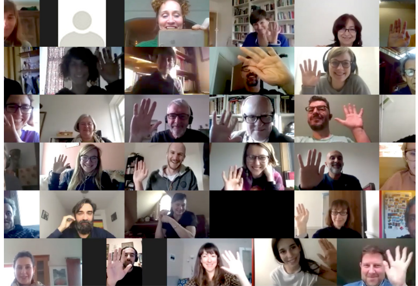
The first IETM Members' talk held on Zoom on 20 March 2020, where members were asked to describe how the network could support them and what they could offer to the rest of the network in the upcoming weeks of lockdown.