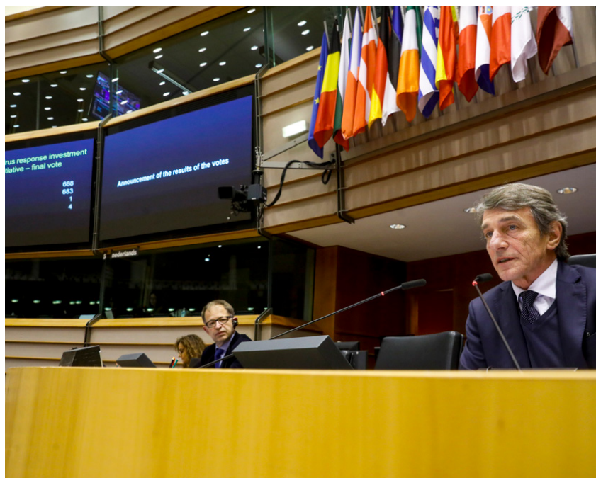
COVID-19: final vote in EP plenary to approve crucial EU support measures

On 23 March, Mariya Gabriel, Commissioner for Innovation, Research, Culture, Education and Youth said on Twitter: "Let us not forget that #Covid19 is also tremendously affecting independent artists all over Europe. We are working with the EU Ministers of Culture to limit the effects of this pandemic and to safeguard an essential part of our European identity and history." Concrete measures are yet to be taken.